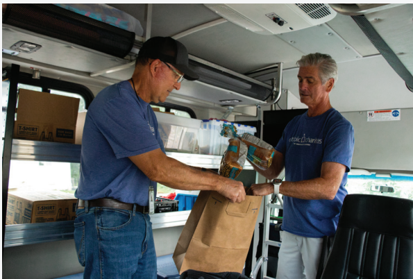
Over 3,600 individuals received food, housing, utility, clothing assistance and hygiene items via the Resource Bus. (July 1, 2024 – June 30, 2025)

With our new programming, more families will efficiently be served across all 21 counties, regardless of location. This program transition is happening in real-time, so the model will continue to adapt to serve the needs of our rural communities. ❖