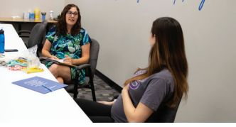
127 families (94 from Wyandotte County and 33 from Johnson County) were referred by Children's Mercy Hospital to Catholic Charities of Northeast Kansas

Families navigating the challenges of a serious illness often face more than just medical concerns. Financial burden due to treatment or long hospital stays can add extra worry to an already stressful situation. Recognizing this, local hospitals, Children's Mercy and St. Luke's Health System, have partnered with Catholic Charities of Northeast Kansas to provide resources to patients and their families. These partnerships will provide Catholic Charities with unrestricted funding to help support individuals referred by the hospitals.