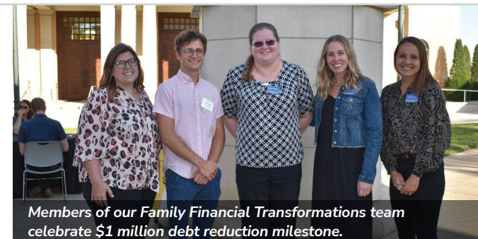
Members of our Family Financial Transformations team celebrate $1 million debt reduction milestone.