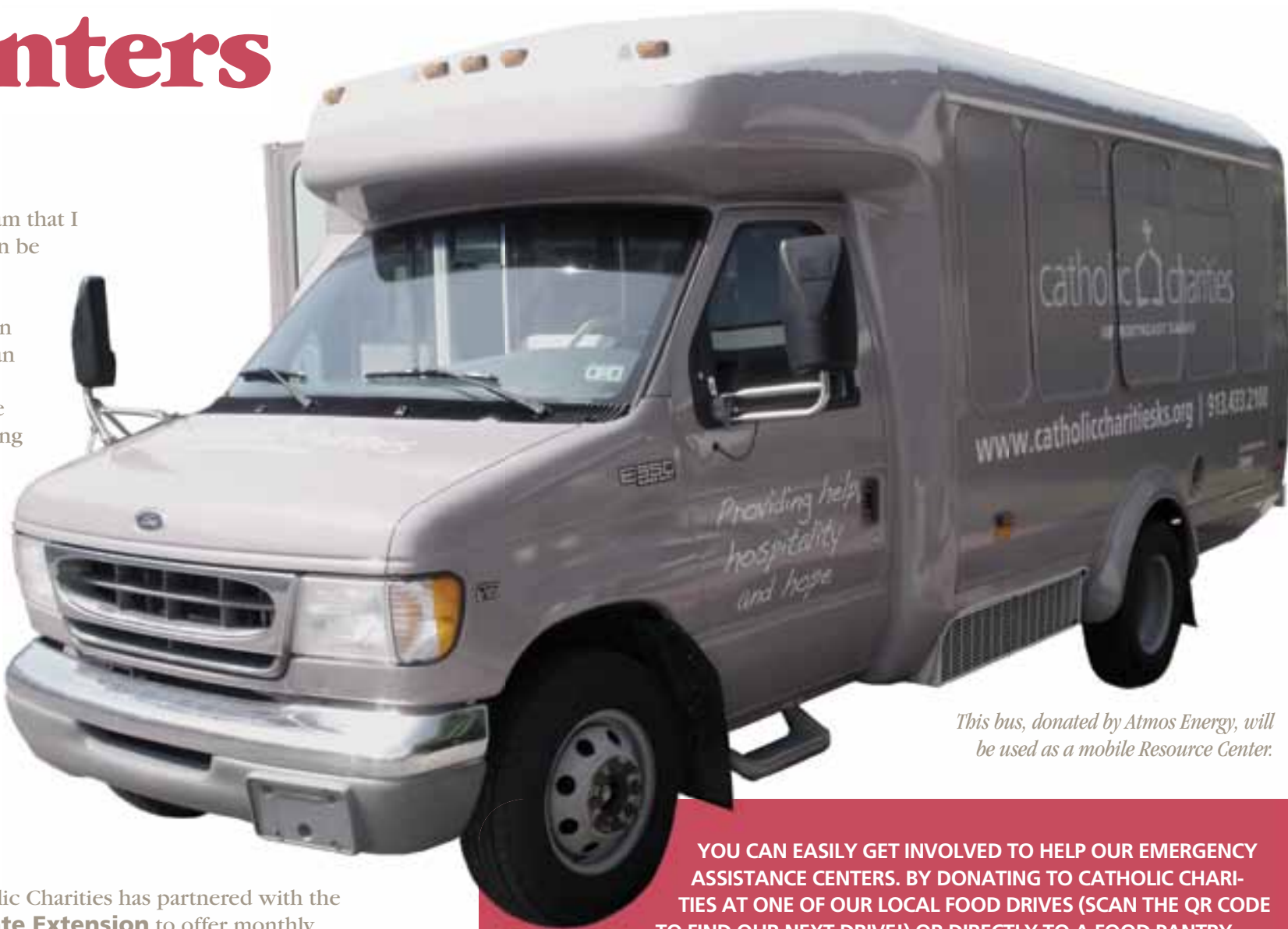
This bus, donated by Atmos Energy, will be used as a mobile Resource Center.

YOU CAN EASILY GET INVOLVED TO HELP OUR EMERGENCY ASSISTANCE CENTERS. BY DONATING TO CATHOLIC CHARITIES AT ONE OF OUR LOCAL FOOD DRIVES (SCAN THE QR CODE TO FIND OUR NEXT DRIVE!) OR DIRECTLY TO A FOOD PANTRY, YOU CAN HELP PUT FOOD ON THE TABLE OF A NEIGHBOR IN NEED. ITEMS WE ALWAYS NEED INCLUDE: