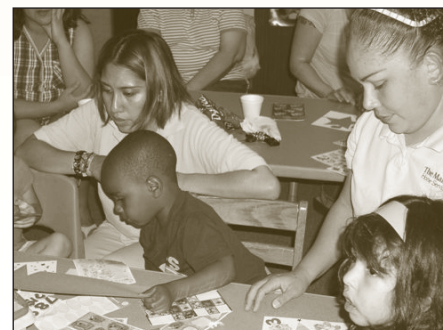
Critical learning comes early at St. Benedict's.