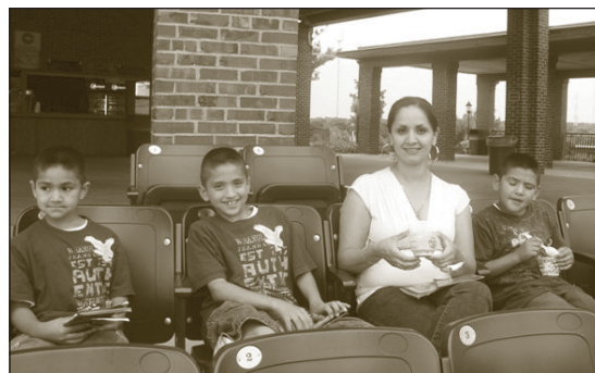
St. Benedict's students on a visit to Starlight Theatre.

"We want to give our children the strong, stable foundation that will help them once they get into public school," she said. "Students who receive quality early